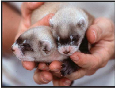
Four week old kits