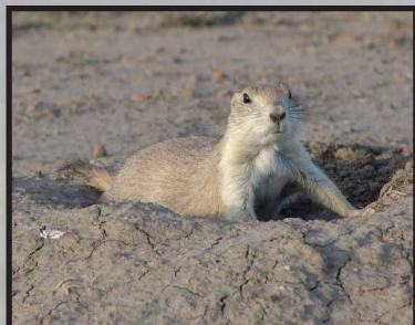
Black-tailed prairie dog