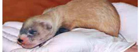
black-footed ferret kit

If you would like to support the Canadian black-footed ferret recovery initiatives please go to our website at torontozoo.com/donations.asp and click on the black-footed ferret box